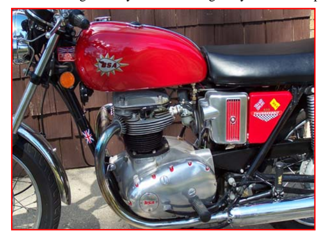
It's amazing how a fresh paint job can breathe new life into an 'old girl'.

The biggest contribution to achieving smooth running for me came with fitting a modern Boyer electronic ignition system. Installing it myself with no prior experience did not come without problems. I