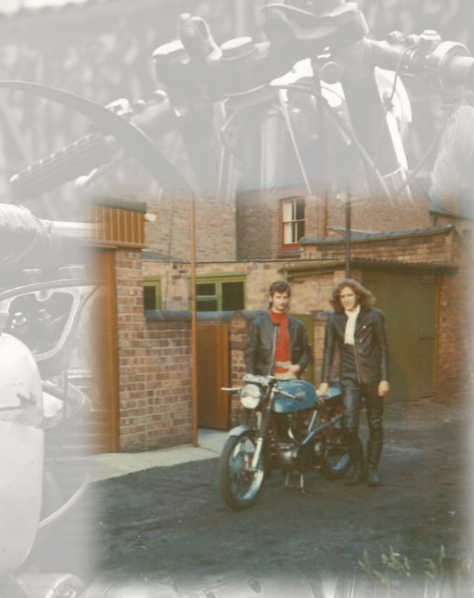
'Photo with friend in Shotton, 1970s'